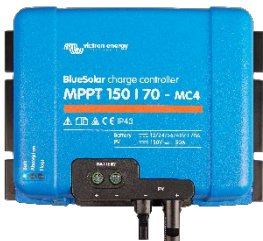
Solar Charge Controller MPPT 150/70-MC4