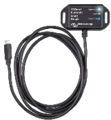
VE.Direct Bluetooth Smart Dongle