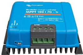
Solar Charge Controller MPPT 150/70-Tr